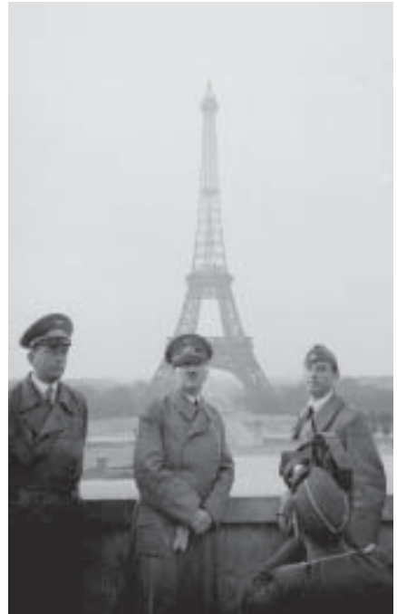
Adolf Hitler visits Paris with architect Albert Speer (left) June 23, 1940.

“By order of General Weygand, Commander in Chief of the French Army, the City of Paris has been declared an open city, and will not be defended by troops of the French Army, in order to preserve the health and safety of the populace. The City of Paris will be surrendered to the German Army.”