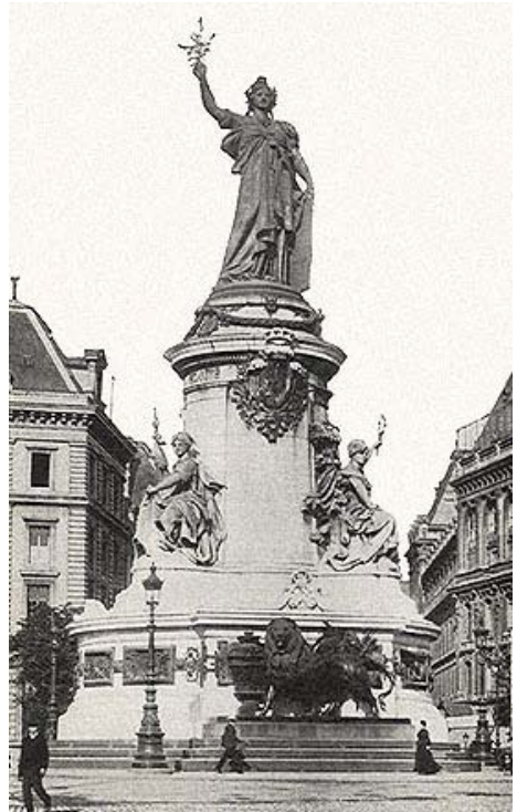
Statue of the Republic

Paris is under martial law. Since yesterday, Paris has been declared an open city. The military commander is General Georges. There is a curfew in effect, which prohibits anyone from being on the streets after dark without a pass. In general, this has been ignored on a local level, though automobiles are being stopped and turned back. The garrison troops have orders to shoot looters.