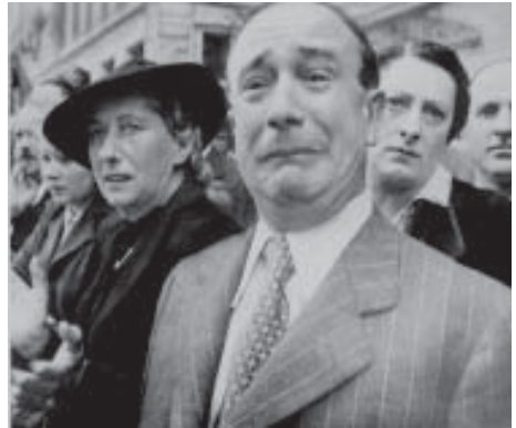
A French man weeps as the Nazis march into Paris, June 14, 1940

This is a story about some people and their adventures in a difficult time. It has no moral, and no message. But it exists against a backdrop that conveys a message basic to all human history. We always live in uncertain times.