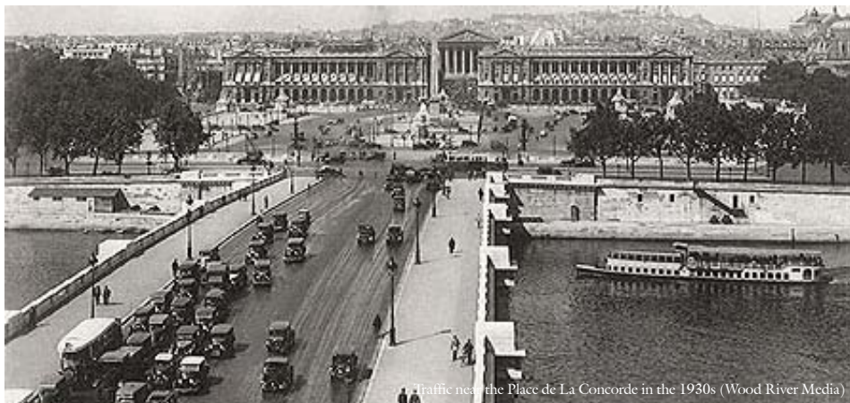
Traffic near the Place de La Concorde in the 1930s

14 Paris occupied shortly after dawn by the Nazis