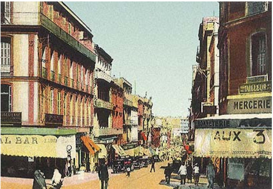
A Paris neighborhood between the wars